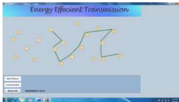
Fig.2 Snapshot for finding shortest Path

LEACH (Low energy adaptive clustering hierarchy) protocol) : To route the path it is assumed that the WSN consists of stationary sensor nodes randomly deployed in an L \times L field and a single mobile anchor node. It is assumed that the mobile anchor node obtains its position coordinates via a x, y co-ordinate. If three beacon points are obtained on the communication circle of a sensor node, it follows that the mobile anchor node must pass through the circle on at least two occasions. LEACH (Low energy adaptive clustering hierarchy) the networks are divided in to the number cluster and the each cluster are divided in to the two parts that is cluster head and non-cluster head. We calculating cluster head by, a node carry much energy is set as a cluster head.