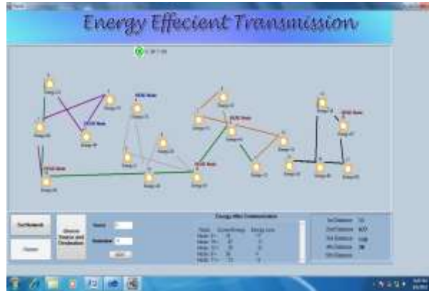
Fig.4 Snapshot for energy loss and total distance

In above snapshot mobile anchor node shows to trace the location of head node in (x,y) direction and also calculate total distance of path after communication with energy loss.