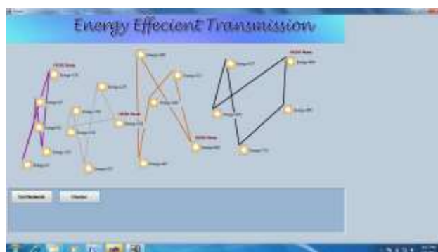
Fig. 3 Snapshot to create the group of clusters

The snapshot second shows that, there are maximum 20 nodes .Each and every nodes add the distances then communication is done in between source and destination to find the shortest path by using Dijkstra's algorithm. Same like that, third snapshot shows that, these all nodes gets the energy to create the group of cluster and We calculating cluster head by, a node carry much energy is set as a cluster head.